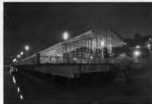
Foss Waterway Seaport