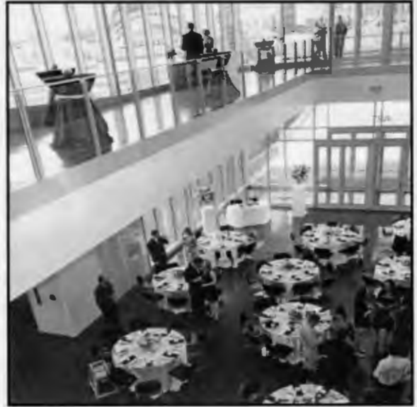
The view from the mezzanine at Tacoma Art Museum

Cultural Access Washington Overview with David Fisher