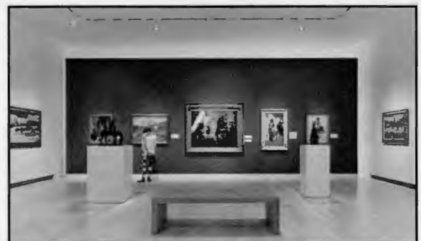
The Haub Family Collection of Western Art at Tacoma Art Museum

Conference is adjourned. Please enjoy the Tacoma Art Museum and explore the galleries and new wing highlighting the Haub Family Collection of Western Art; admission is included, compliments of the Tacoma Art Museum.