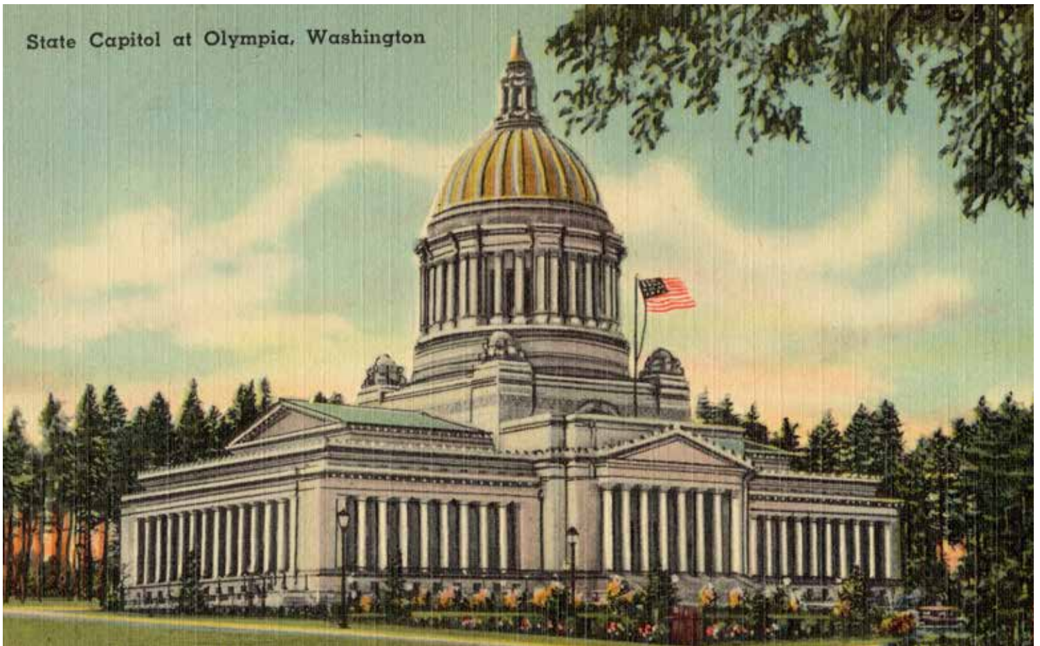
State Capitol at Olympia, Washington