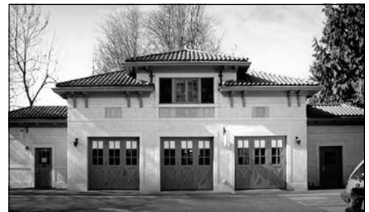
The Lord Mansion Coach House