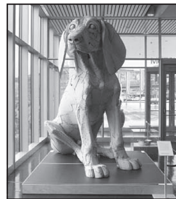
Leroy, the Big Pup at Tacoma Art Museum