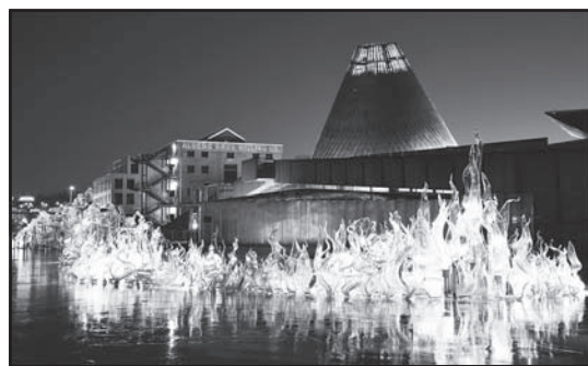
Museum of Glass

$15 / Pre-registration required; attendance limited to 20.