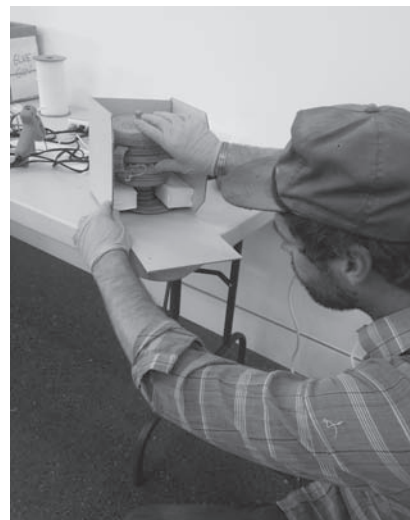
R2R 2015 volunteer at Maryhill Museum of Art, Goldendale.

If you are a registrar or collections specialist, please join us if you are coming to the WaMA Annual Conference or just for the day. It is an excellent networking opportunity!