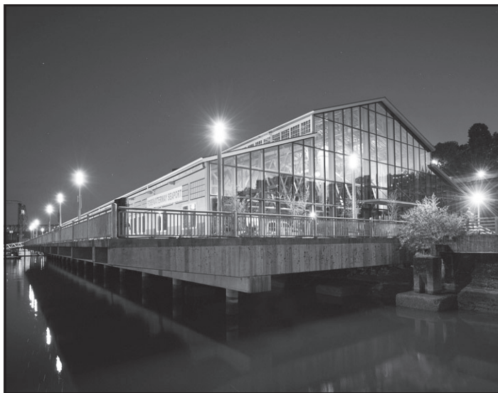
Foss Waterway Seaport

6:00 PM–8:30 PM Take a water taxi up the Thea Foss Waterway to the Foss Waterway Seaport,