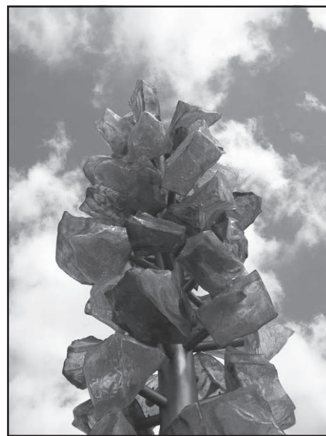
Crystal Towers on the Chihuly Bridge of Glass at the Museum of Glass