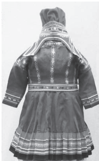
Child's dress made by Eastern Saami (indigenous group from Scandinavian and Kola Peninulas), circa 1960s. Silk with handwoven trim, in the collections at the Scandinavian Cultural Center, Pacific Lutheran University.