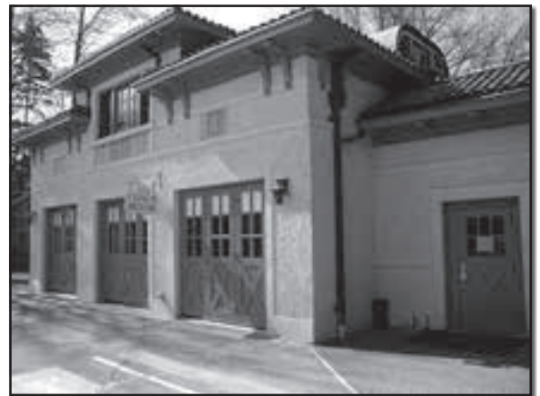
State Capital Museum Coach House

Arts & Heritage Day Kick-off at Heritage Caucus at 7AM in the Cherberg Building on the Capitol Campus. Sponsored by the Washington Museum Association and the Washington State Arts Alliance. www.washingtonmuseumassociation.org and www.wsartsalliance.com