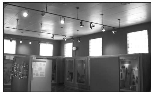
Thanks to a $46,000 grant from the Clark County HPG program, the Clark County Historical Museum was able to do $21,000 of gallery and case lighting upgrades.