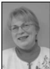
New to the WMA Board