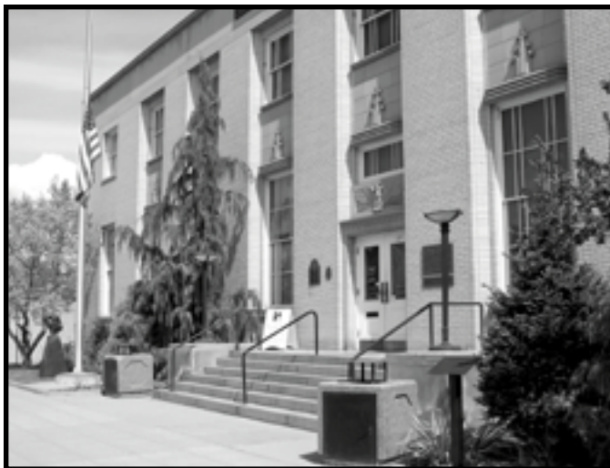
Wentachee Valley Museum and Cultural Center, 2007 conference host..