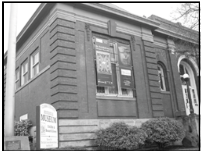
Clark County Historical Museum, 2008 conference host.

COME TO VANCOUVER WASHINGTON JUNE 18-20, 2008!